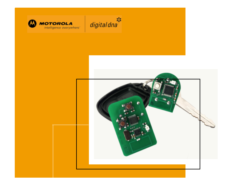
Access and Remote Control Systems