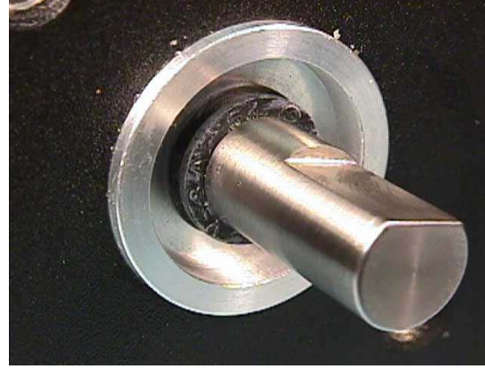
HD2, HD4 Seal

The price for the higher performance IP-65 seal used with the HD12 and HD14 will remain the same as the previous seal used on the HD2 and HD4.