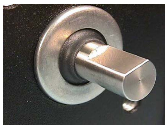
HD12, HD14 Seal