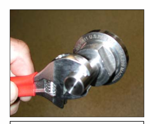
An adjustable wrench or end wrench can be used in the shaft notch to provide additional control for installation and removal