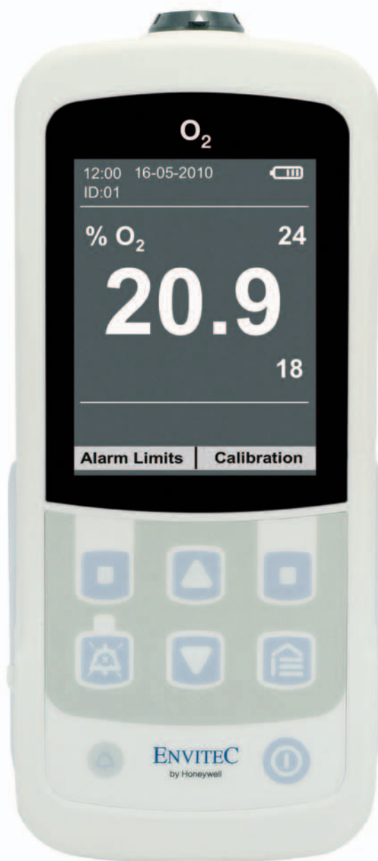
The MySign®O (actual size)