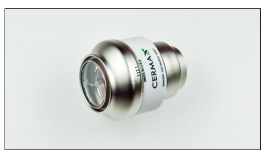
Cermax<sup>®</sup> Xenon short-arc lamps from Excelitas Technologies are ideal for applications that require a high degree of illumination control.

The Cermax<sup>®</sup> Xenon short-arc lamp from Excelitas Technologies is an innovative lamp design in the specialty lighting industry. Cermax<sup>®</sup> Xenon lamps were first introduced in the early 1980s and are now used in diagnostic and surgical endoscopes in most major hospitals worldwide, in high-brightness projection display systems, and for a wide variety of high-performance applications.