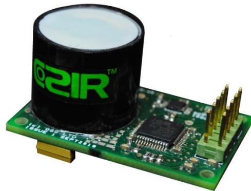
COZIR™ Wide Range Sensor