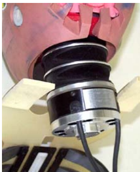
Fig. 2: Application sample, mounted at lower neck location