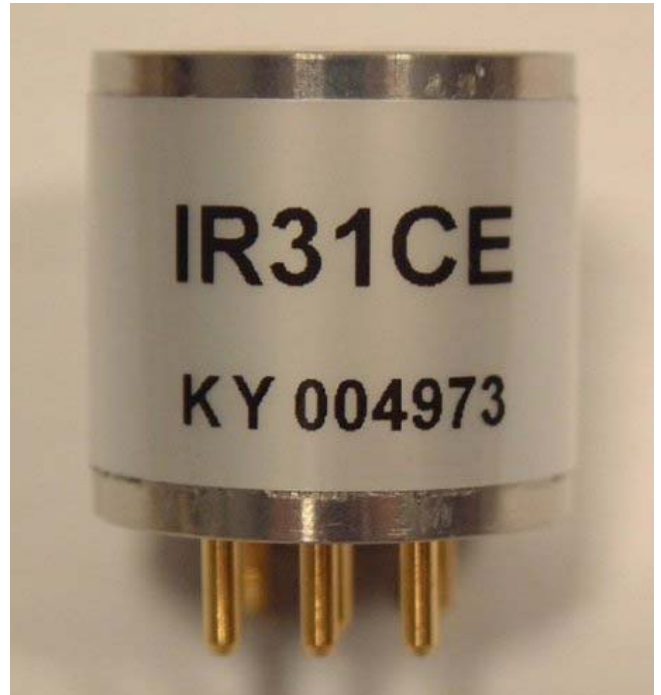
(Photograph shows device approximately 3 x actual size)

Infrared Sensor Application Note 6: Advice for Using Infrared Gas Sensors in Mining Applications