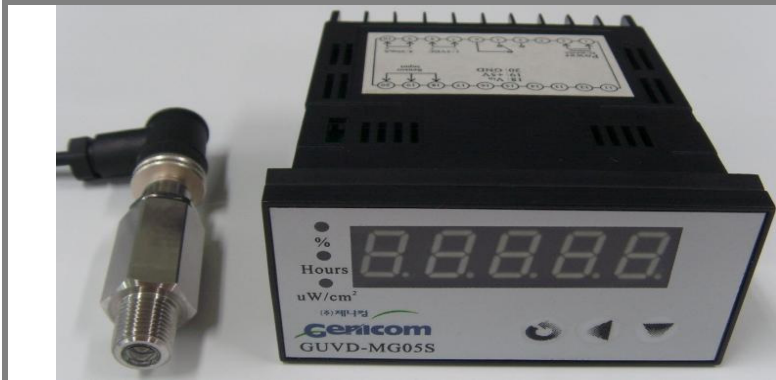
Fig. 1 UV Radiometer 5.0 (Size of Display : 97 × 50 × 112mm)