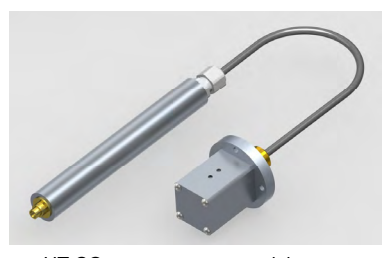
HT CO<sub>2</sub> measurement module