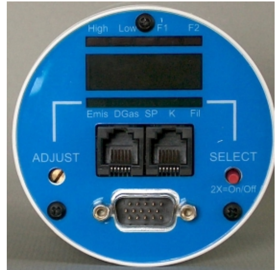
USER CONTROL INTERFACE