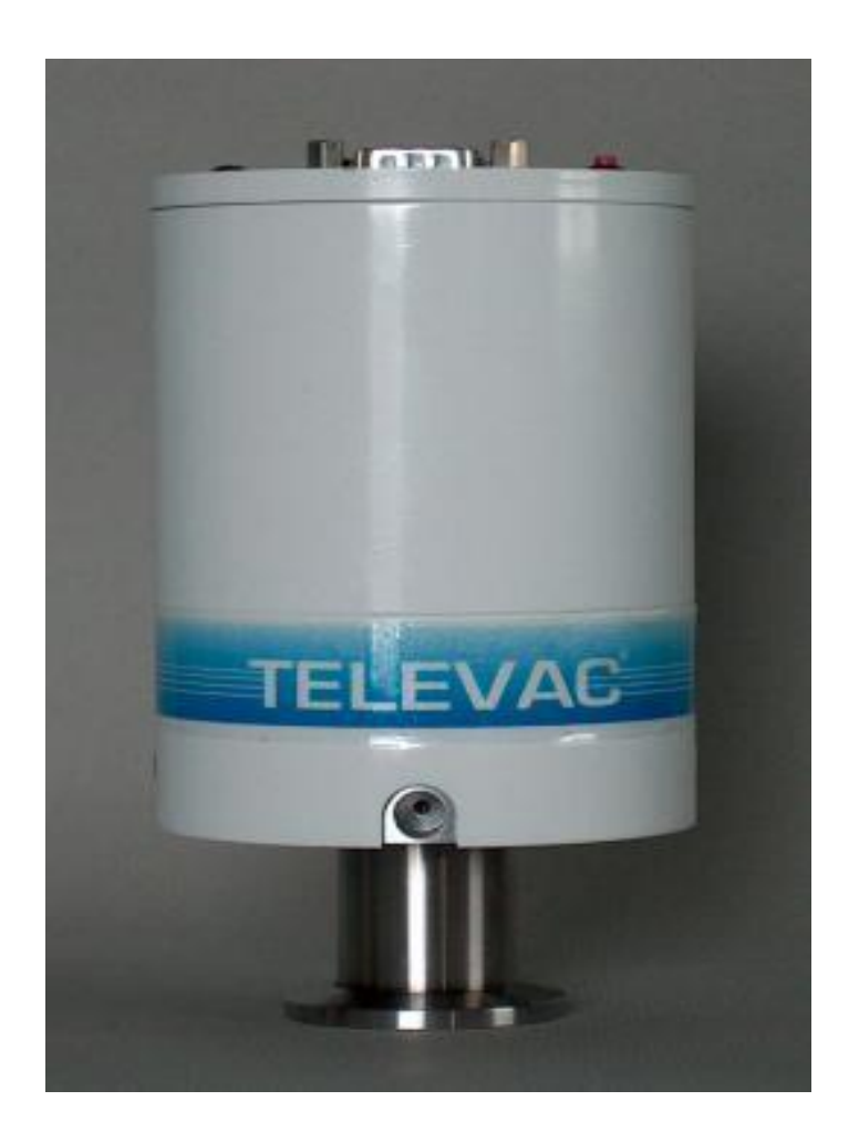
Televac...The Finest In Vacuum Instrumentation