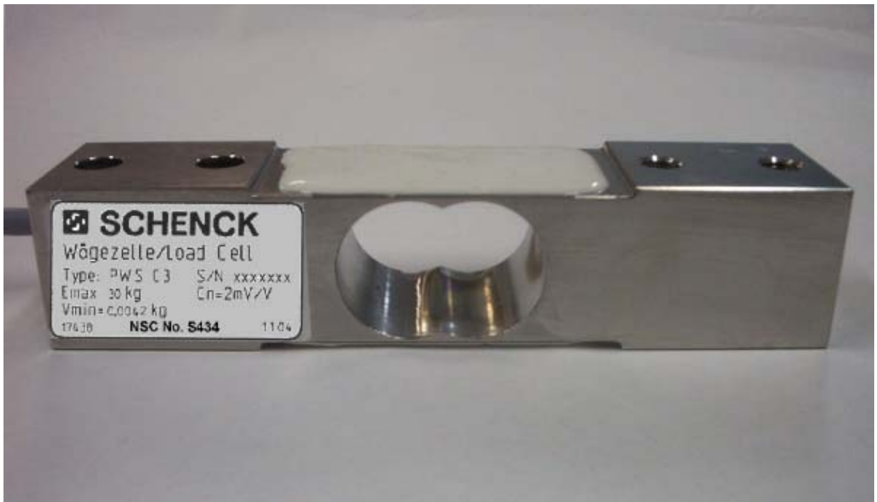
Schenck Model PWS Load Cell