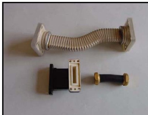
CFT & CFW Series