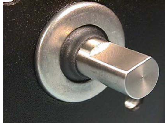
HD12, HD14 Seal

assist customers converting HD2 and HD4 part numbers to HD12 and HD14.