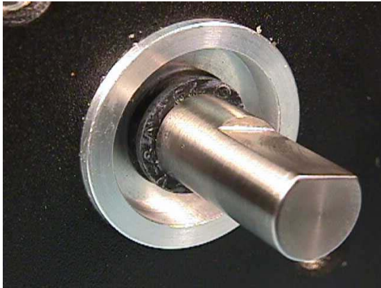
HD2, HD4 Seal

The price for the higher performance IP-65 seal used with the HD12 and HD14 will remain the same as the previous seal used on the HD2 and HD4.