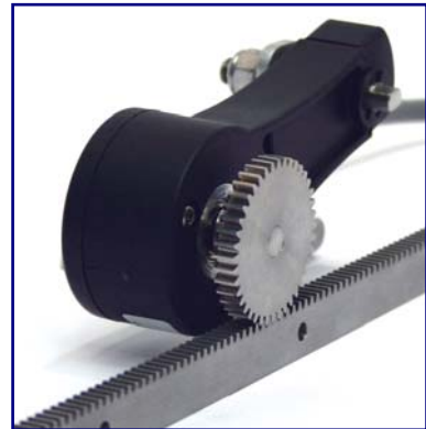
Perfect TR2 Rack and Pinion Fit