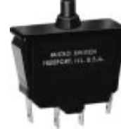
WW Page 92