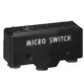
BZ-BM Page 47