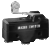
BA-BE Page 47