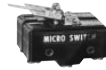
6AS Page 74