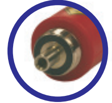
Ferrule 2.5 mm