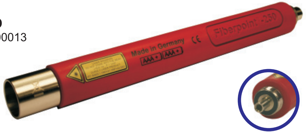
Ferrule 2.5 mm