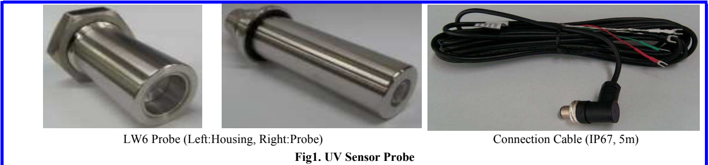
LW6 Probe (Left:Housing, Right:Probe)