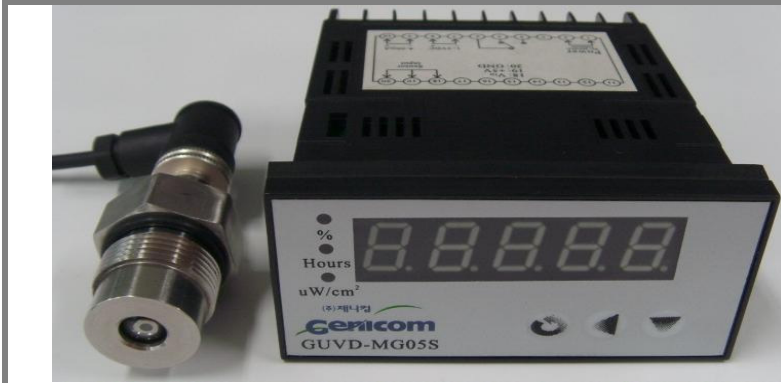
Fig. 1 UV Radiometer 5.0 (Size of Display : 97 × 50 × 112mm)