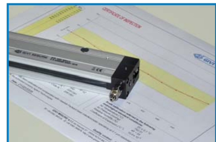
Example of certificate of metrological inspection which is supplied with every optical scale.