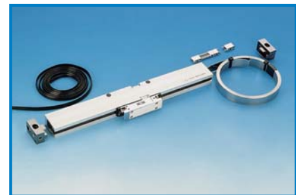
Mounting kit of the optical scale in modular version for applications on big-sized machines.