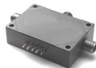
SPDT module shown above with SMA connectors