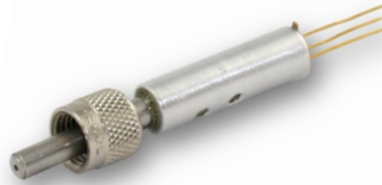
SMA Fiber Coupled LED