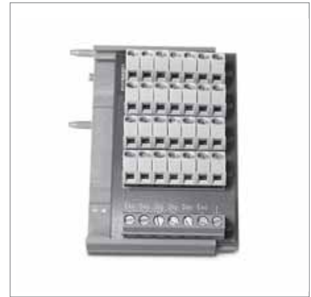
MP 20/30 four LC junction unit