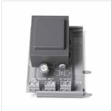
MP 20/20 110/230 V AC power supply