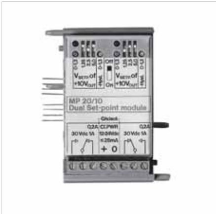
MP 20/10 dual setpoint unit