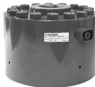
Shown with optional base